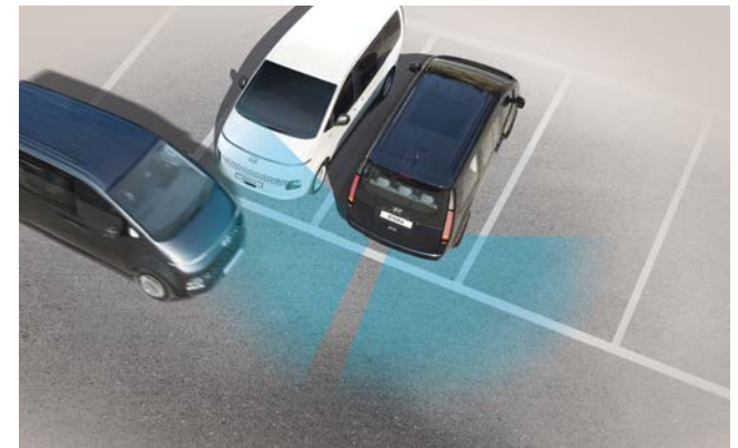
Rear Cross Traffic Alert