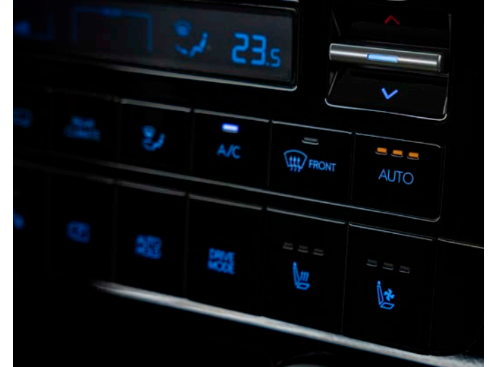
Auto climate control