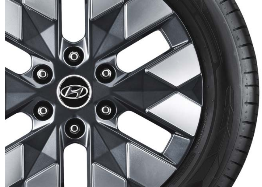
18-inch alloy wheels