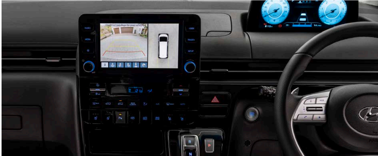
Surround view monitor

With a full 360 camera, the driver can enjoy an all-round view of the car's exterior and its surrounding environment, while passengers can sit back in luxurious Nappa leather finished seats. Comfort is of the highest priority with heated and ventilated front and second row seats and independent swivelling seats in the second row.