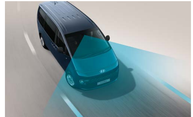
Lane Keep & Lane Follow Assist