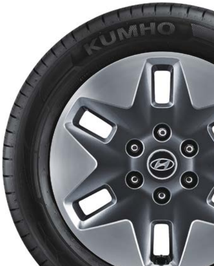
18-inch alloy wheels