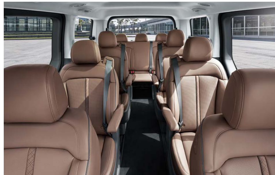
9-seater Luxury interior