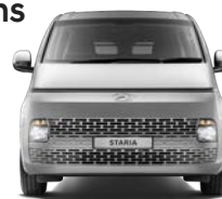
Overall width 1 997 mm