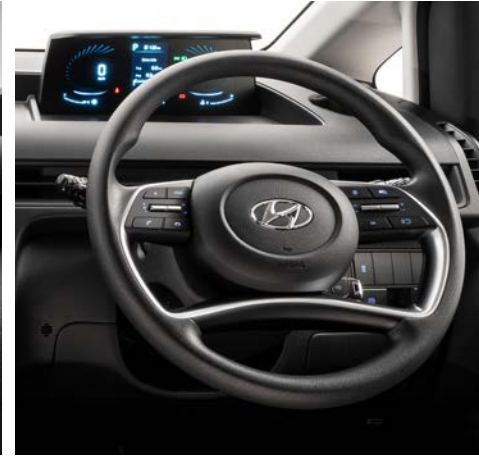
Multifunction steering wheel with cruise control