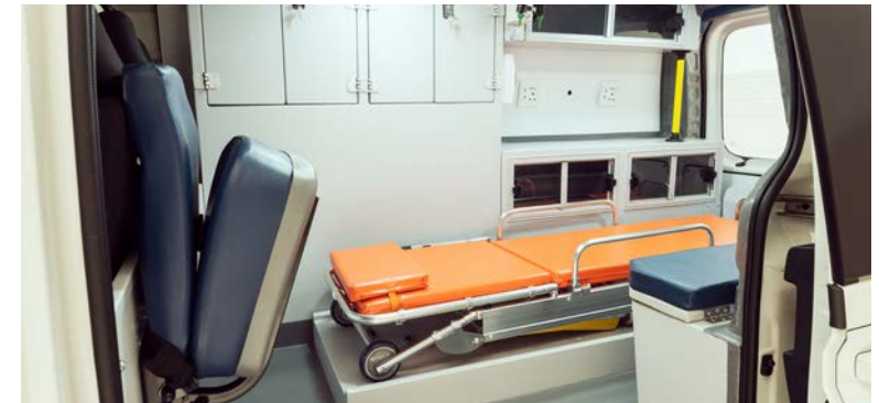
Customisable ambulance interior