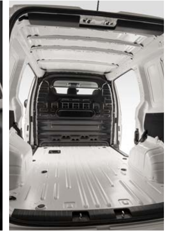
Tie-down clips to hold cargo