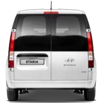
Ground clearance 186 mm