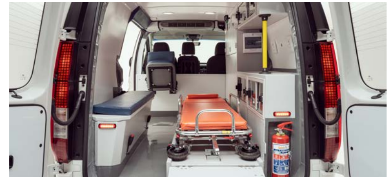
Fully functional interior