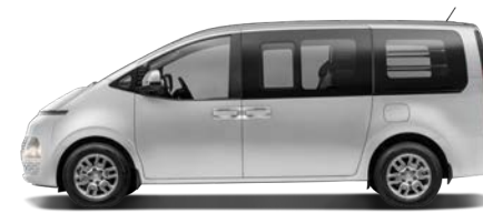
910 mm Wheel base 3 273 mm 1 070 mm