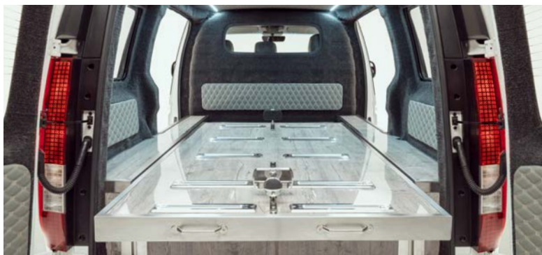
Raised floor with additional storage