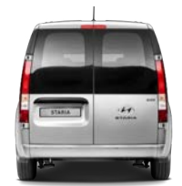
Ground clearance 186 mm