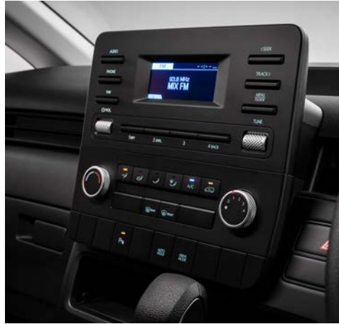
Audio & manual aircon

In addition to its 4 935 litre cargo space, the new STARIA comes standard with 17-inch alloy wheels, a multi-purpose steering wheel, park distance control, Bluetooth and cruise control.