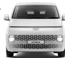
Overall width 1 997 mm