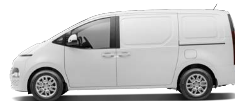
910 mm Wheel base 3 273 mm 1 070 mm Overall length 5 253 mm