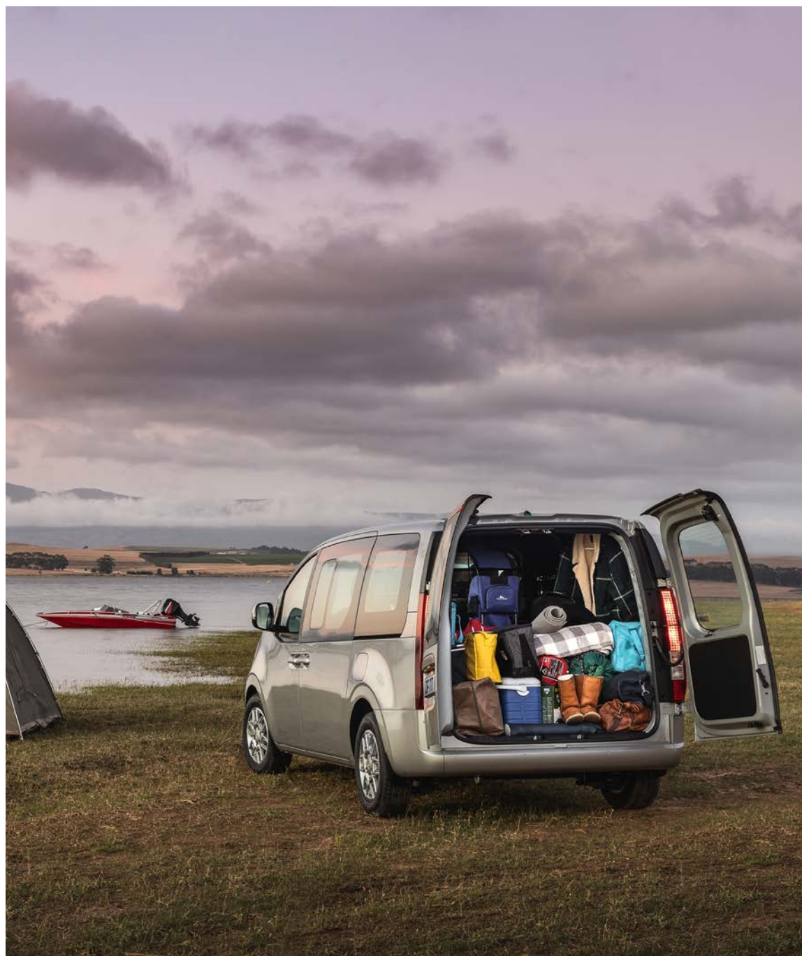
2 890 litre VDA cargo space